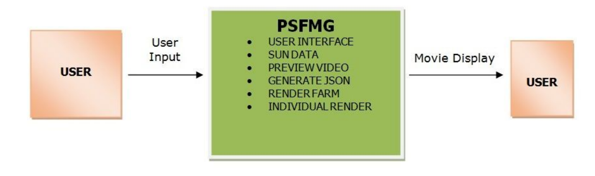
Figure 1-1: Level 0 DFD